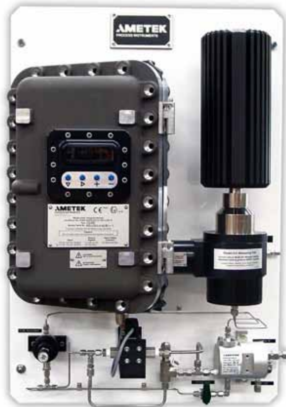
Model 241CE II Hydrocarbon Dew Point Analyzer - European version shown on backpan. Analyzer must be installed in an environmentally controlled building or shelter.

A fully integrated sample system package, including proprietary designed for natural gas samples, protects the analyzer from common natural gas contaminants (aerosols, particulates and liquid slugs) and ensures reliable, fast, and accurate means of detecting the hydrocarbon dew point temperature in natural gas applications.