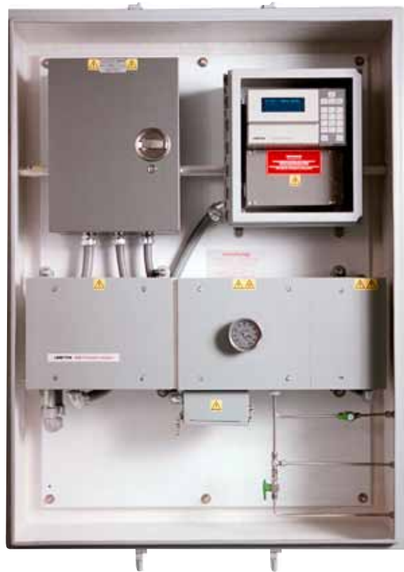
Typical Model 4000 Photometric Analyzer with a sampling system