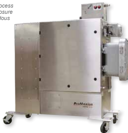
Figure 2. AMETEK's ProMaxion process mass spectrometer in NEMA 4X enclosure is available with ATEX or NEC hazardous area protection.