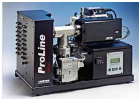
Figure 2. ProLine Process Mass Spectrometer for general purpose locations.

8-valve system, five reactors can be controlled. Using one instrument also allows all of the data to be compared and catalogued more easily. Furthermore, GMP needs are met by logging all important events such as calibrations in a separate file. The weatherproof ProMaxion version offers up to 32 inlet ports for greater flexibility or for harsh environment locations. The ProMaxion is also available with hazardous area approval.