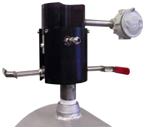
Fig. 3. HAG Probe

AMETEK Process Instruments has a fifty year history of providing process analyzer solutions to the sulfur recovery industry. The measurement, the sample system, the safety and the experience to implement feed forward analysis into a SRU are brought together to provide this solution. Each application has unique requirements and we suggest you contact your AMETEK representative to arrange a detailed review of your requirements.