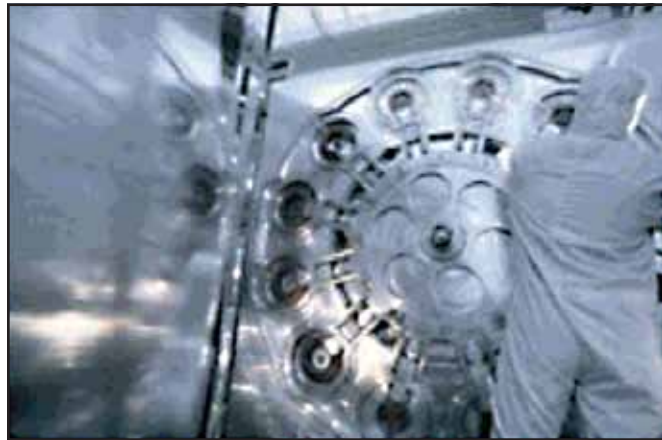
Figure 3. Unaxis Circulus M12 deposition system.

Dycor scripts are used to customize the operation of the analyzer and data gathering to Seagate's specific requirements for the run. A common script instructs the Dycor RGA to plot trend data and save it to a file. When an "out-of-spec" limit occurs, the RGA performs an analog scan, saves the data, and then returns to process monitoring without any operator intervention. In addition, an alarm output signal from the Optomux unit is sent to the process tool. A decision can then be made as to whether or not the run should be stopped.