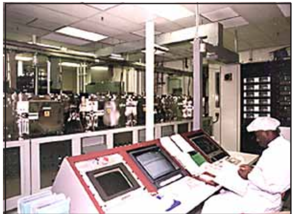
Figure 2. System 2000 software is used in Seagate's control room to run the RGAs.

Seagate uses a Dycor RGA on each chamber of the deposition system (Fig. 2). In some areas of the tool, only the sensor head is installed for infrequent analysis of that area.