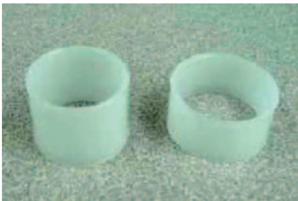
Easy assembly with film window