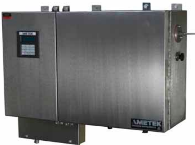
Built-in verification and validation

AMETEK 5100HD TDLAS uses two methods to guarantee users the level of comfort they need to have about their analyzer. One is the built-in verification that insures the integrity of the analyzer performance (making sure the analyzer is working the way it is intended). The second method is the calibration validation where a known challenge (bottled gas etc.) can be introduced on demand or periodically to validate the analyzer calibration. The second method tests the whole analyzer system (analyzer and the sample conditioning) and eliminates sample conditioning induced errors.