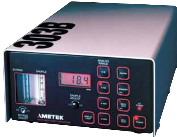
Portable, Digital Display, Highly Accurate, Proven Performance, No Calibration Needed

The 303B is available with a choice of power sources covering AC, external DC, and internal battery operation. With an optional carrying