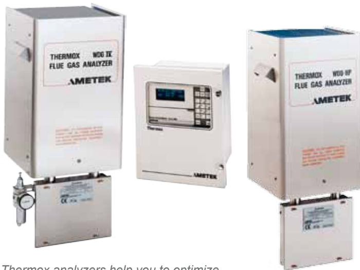
Thermox analyzers help you to optimize combustion efficiency and minimize NOx emissions.