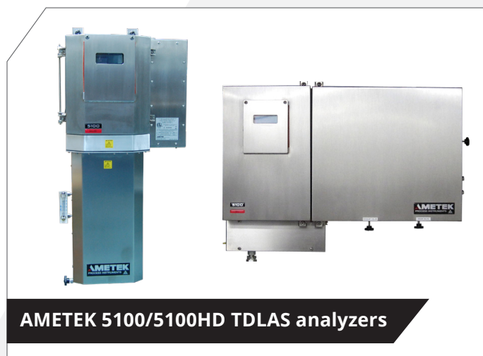
AMETEK 5100/5100HD TDLAS analyzers

trace-species monitoring, and leak detection. A variety of different analytes have been addressed by this technique (e.g. CO, NO, CO 2 , NO 2 , CH 4 , NH 3 , O 2 , H 2 O, HCl, HF, and HBr).